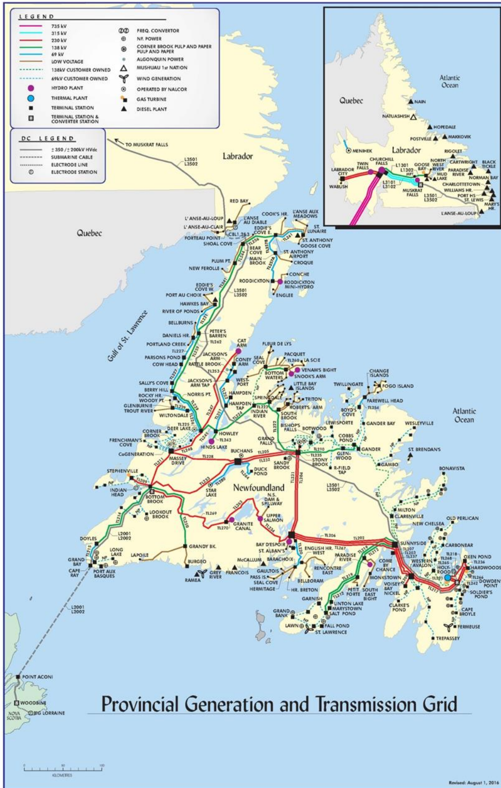
Figure 1: Hydro's Generation and Transmission Infrastructure